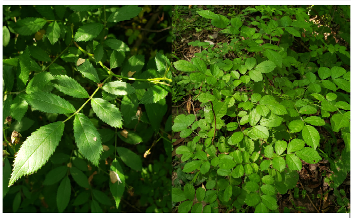
Above: Multiflora rose leaf and thicket

SDA is an equal opportunity provider and employer. Feb. 2010