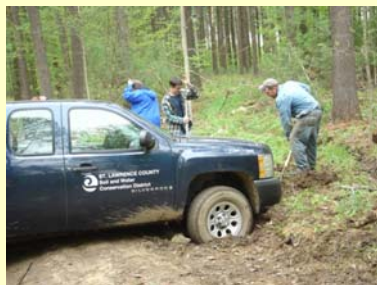
"You haul a sixteen tons...."