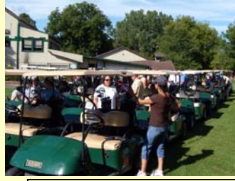
In the beginning....